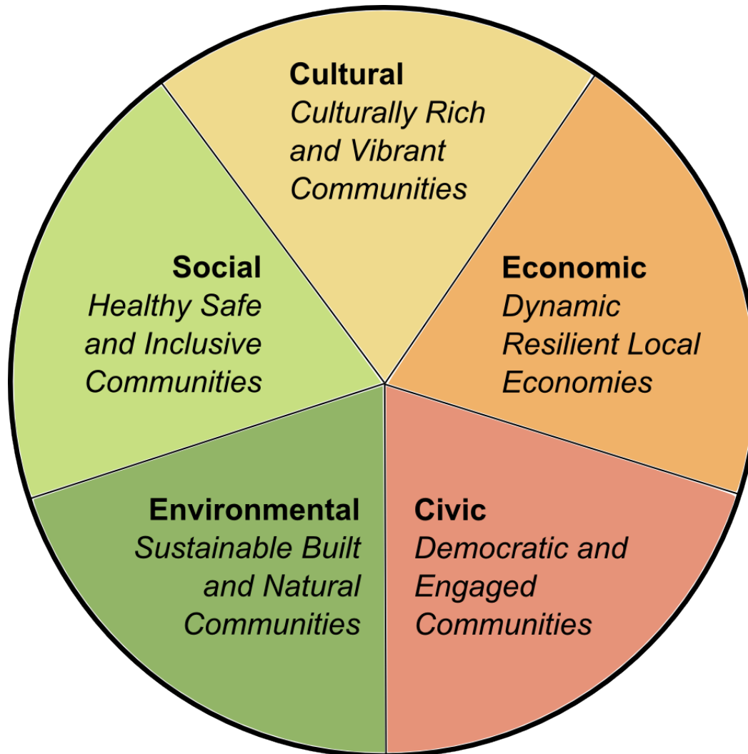
Community Indicators Victoria (CIV, 2006 – 2016)

Capital cities acknowledged the five key public policy domains