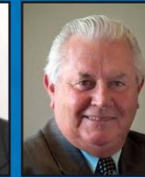
CR BOB MERRIMAN Mayor Borough of Queenscliffe