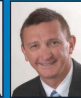
CR DEAN WEBSTER Mayor Surf Coast Shire