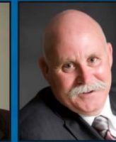
CR JOHN MITCHELL Mayor City of Greater Geelong