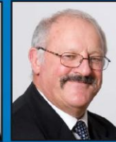
CR BRIAN CROOK Mayor Colac Otway Shire