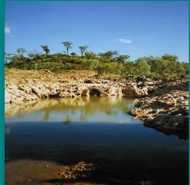
Dalrymple Shire, central Queensland