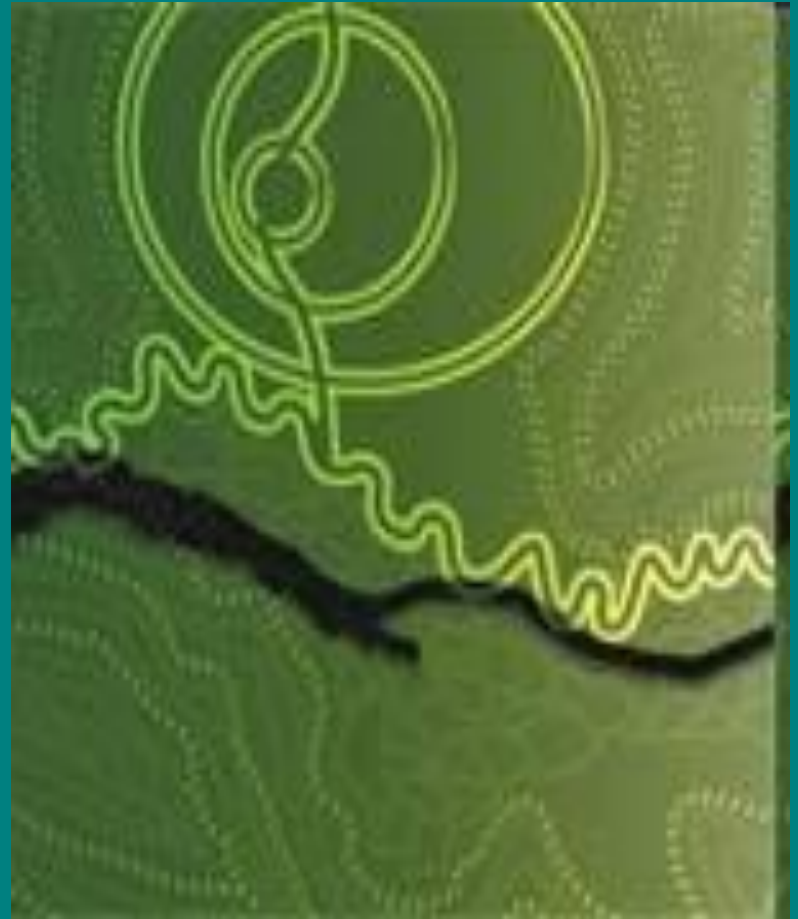
Generations Project, Geelong, Victoria